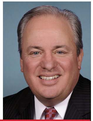
Congressman MIKE DOYLE 14th Congressional District

and the Veterans Leadership Program of Western PA are hosting