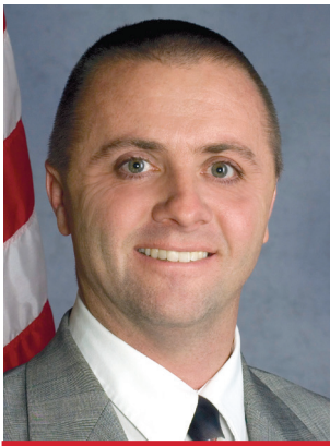
State Representative DAN DEASY 27th Legislative District